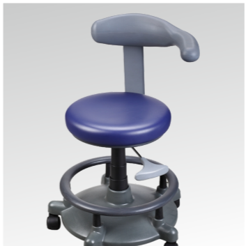
Luxury Nurse's Chair ( For Option )