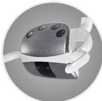
LED lamp ---available for option ---Model:D3