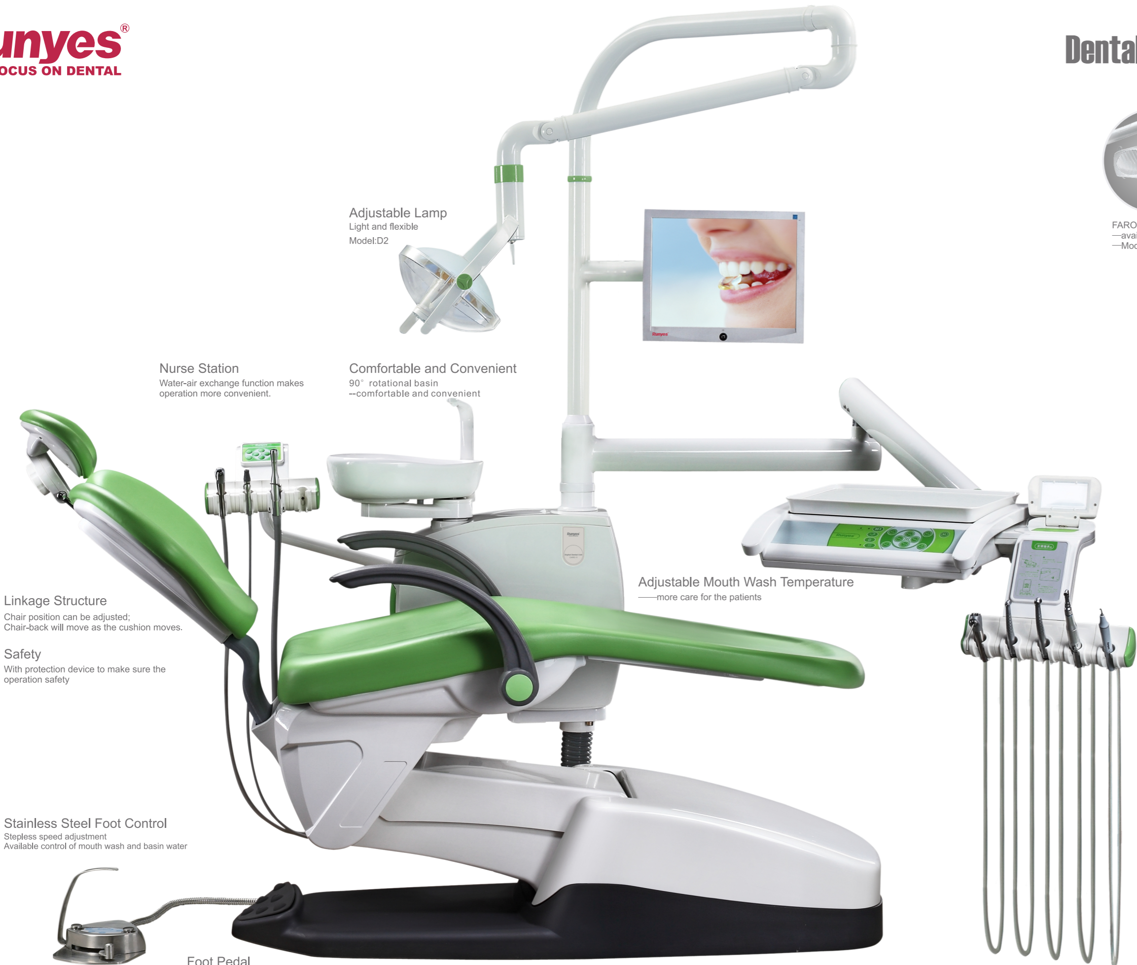
Adjustable Lamp Light and flexible Model:D2