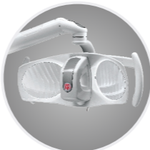
FARO LED lamp ---available for option ---Model:D4