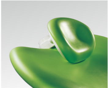
Double joint headrest: it can bring patients a comfortable position and can be used for special patients.