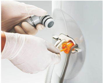
Detachable filter for easy cleaning Dirt separator---avoid jam