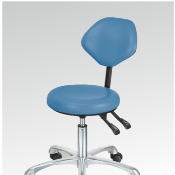
Luxury Doctor's Chair ( For standard configuration)