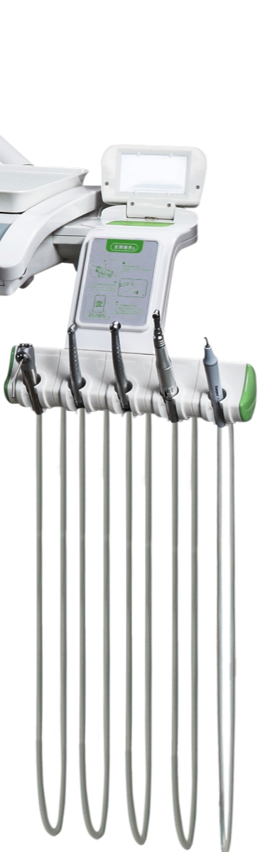
Creative Rack Detachable parts of the rack Adjustable space from the board.