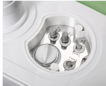
Top location of storage bottle mouth, easy for refilling. Meet the demands of water- break and pipeline sterilization