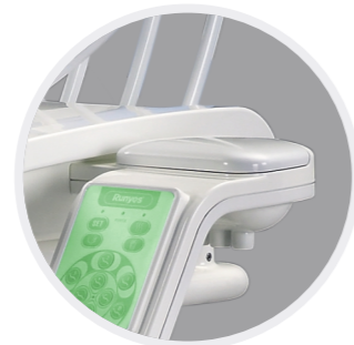
Clamshell Type Film Viewer When film viewer is closed, the space of reaching medicine is more open