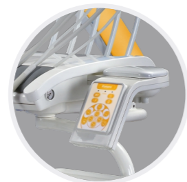
Clamshell Type Film Viewer When film viewer is closed, the space of reaching medicine is more open