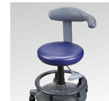
Luxury Nurse's Chair ( For Option )