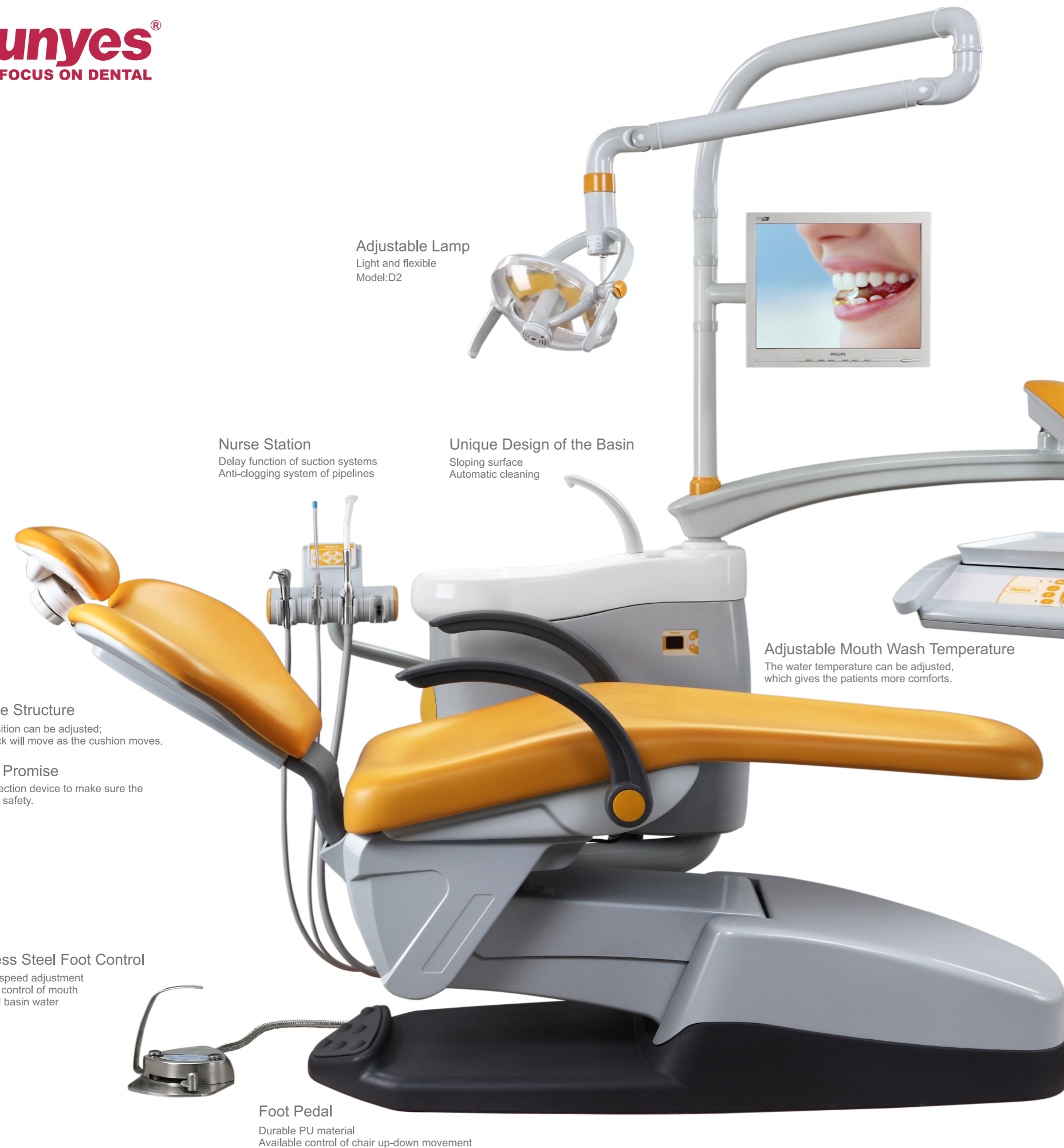
Adjustable Lamp Light and flexible Model:D2