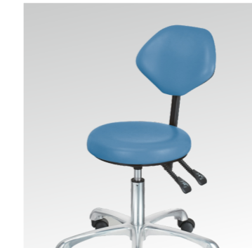
Luxury Doctor's Chair ( For standard configuration)