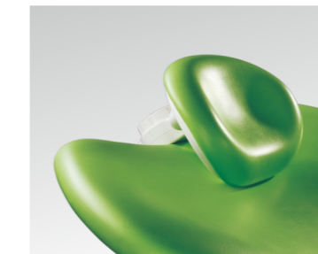
Double-joint head setting creates a satisfying position and is accessible to special patients such as children.