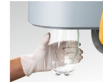
Water storage can be taken down and refilled.