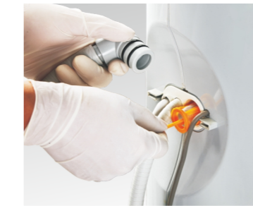
Detachable filter for easy cleaning Dirt separator—avoid jam