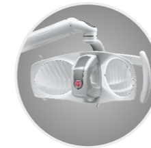
FARO LED lamp —available for option —Model:D4